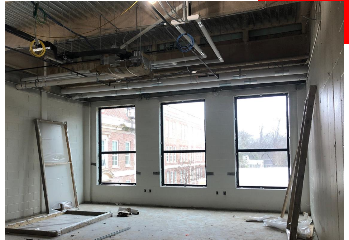
South Elevation Window Progress