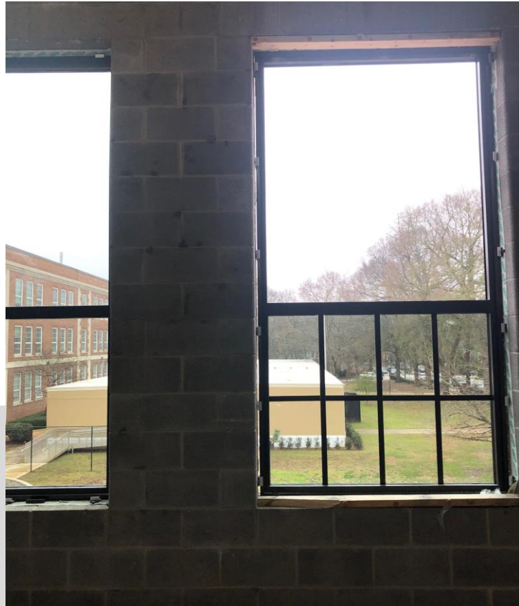
South Elevation Window Progress