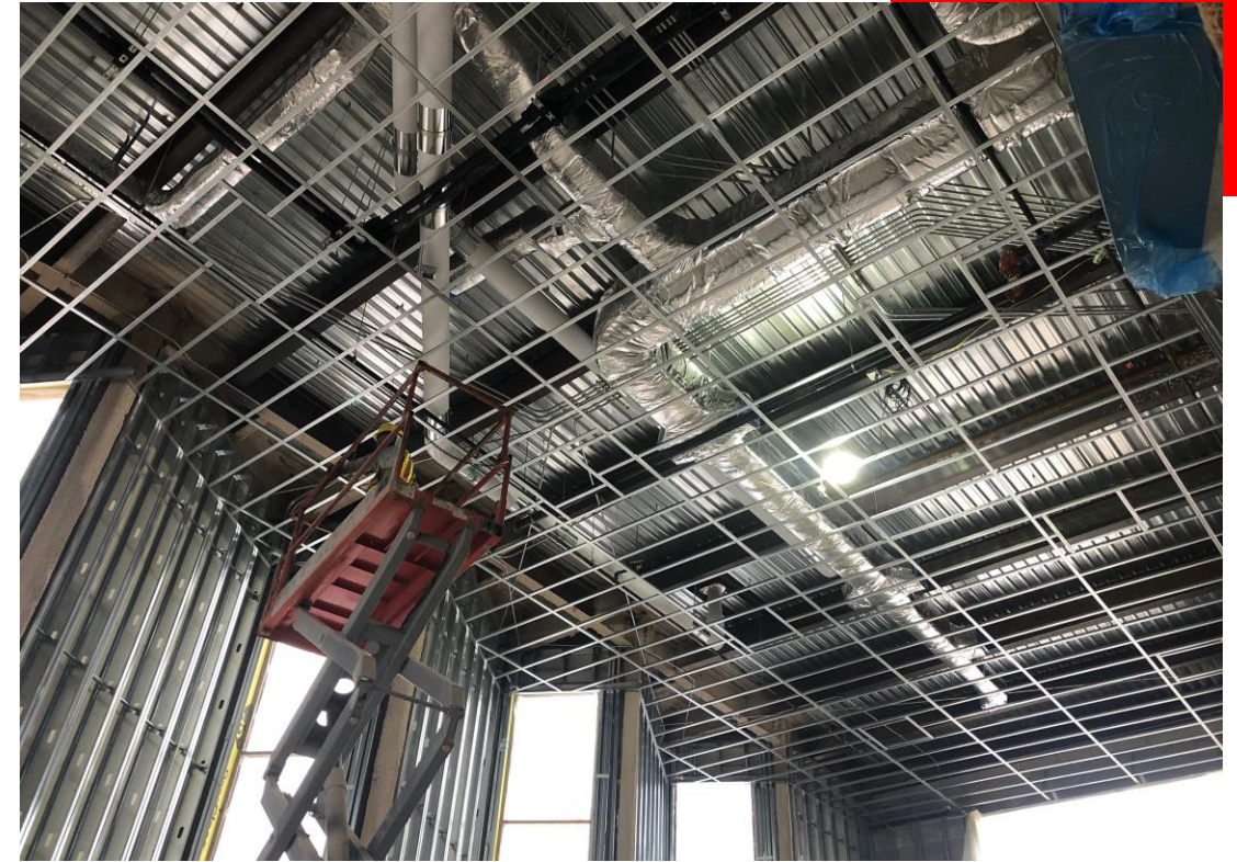
Media Center Ceiling Framing Progress